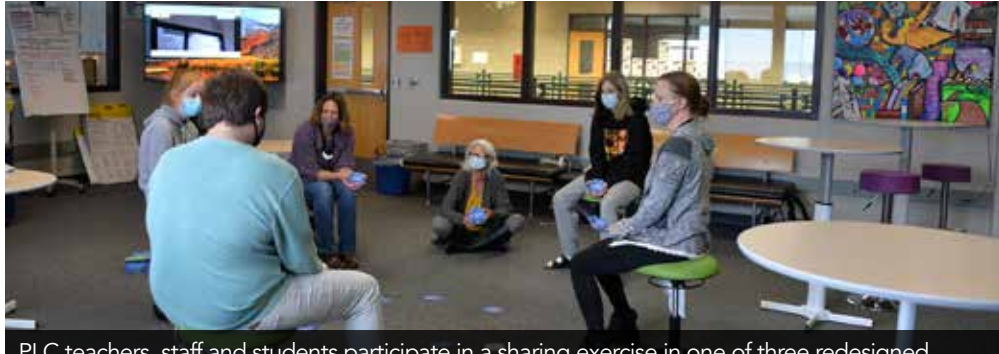
PLC teachers, staff and students participate in a sharing exercise in one of three redesigned classrooms that makes up PLC now located in BHS.

The PLC vacancy allowed for the PRIDE Transition program to move in. PRIDE is a specially designed instructional program for students with disabilities ages 18-21 that provides a transition from the high school environment to the community or post-secondary educa-