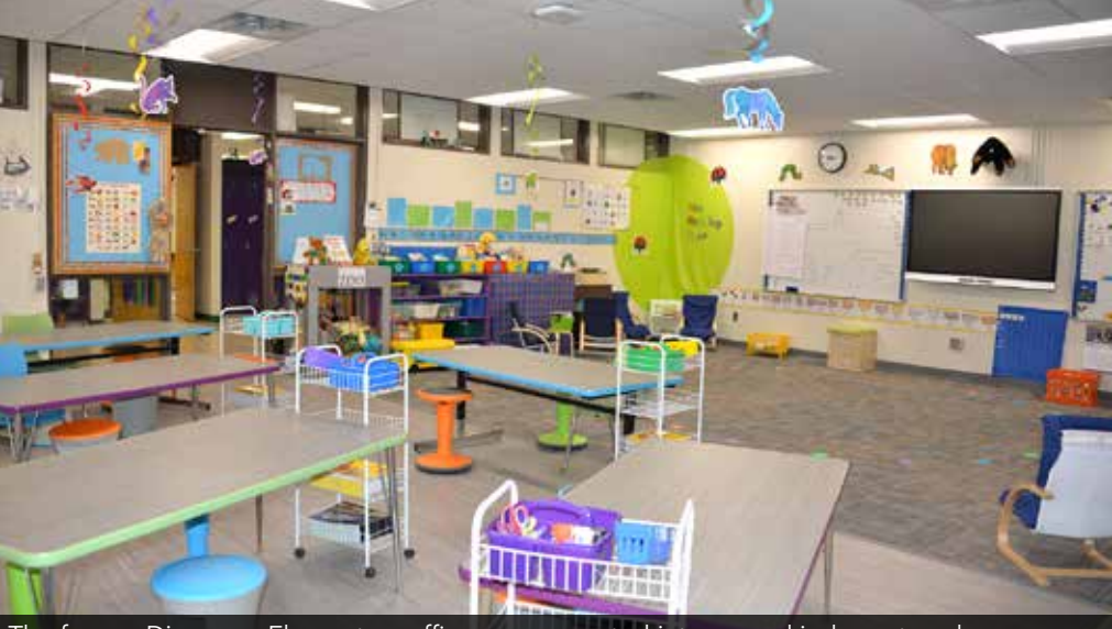
The former Discovery Elementary office was converted into a new kindergarten classroom.