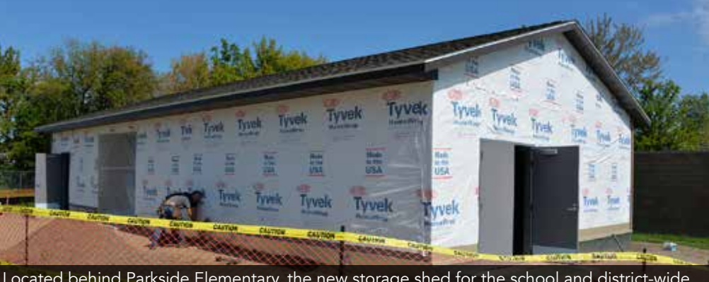
Located behind Parkside Elementary, the new storage shed for the school and district-wide maintenance is almost complete.