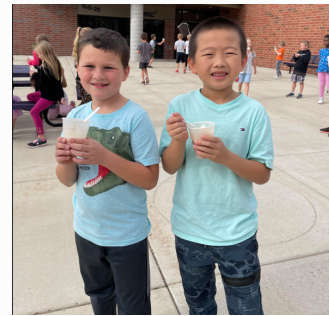
2nd grade sweet treats learning about solids, liquids and gas!