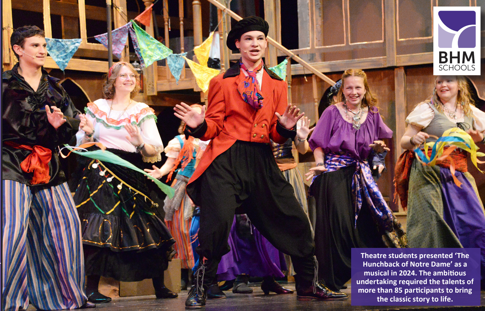
Theatre students presented 'The Hunchback of Notre Dame' as a musical in 2024. The ambitious undertaking required the talents of more than 85 participants to bring the classic story to life.