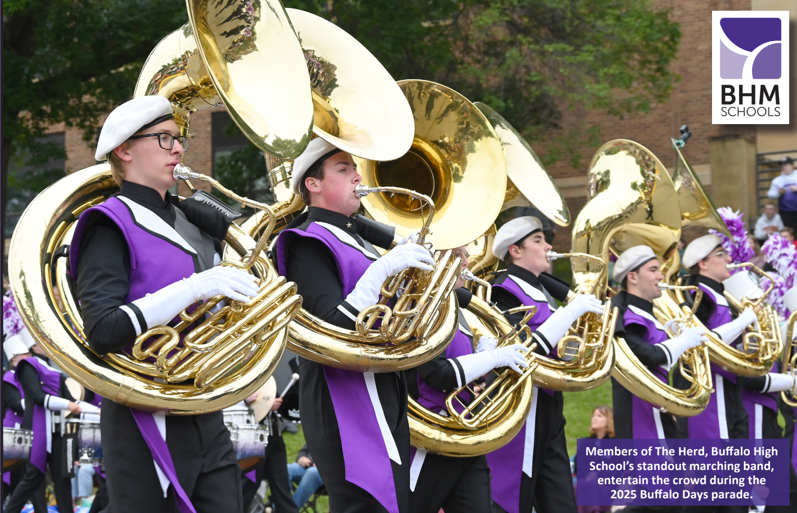
Members of The Herd, Buffalo High School's standout marching band, entertain the crowd during the 2025 Buffalo Days parade.

This year's calendar features the Top 10 reasons to attend Buffalo-Hanover-Montrose Schools. See details in the months ahead!