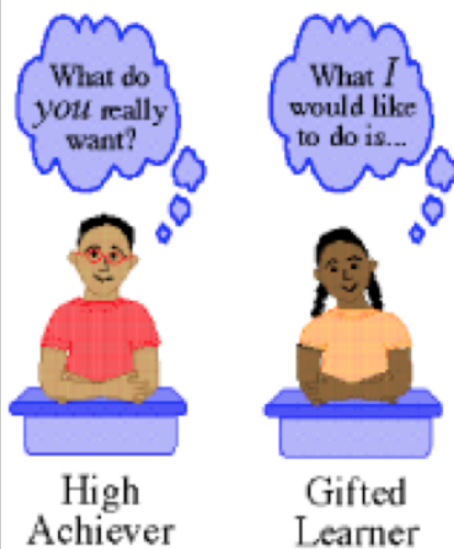
Response to an assignment

-If so, the Quest might fit the academic needs of your child.